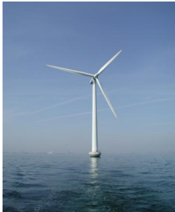
Wind power is abundant & clean