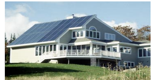
Free sunshine can light & heat for less

To become a member, complete the form to the left or join online www.RenewableEnergyLongIsland.org/join.cfm