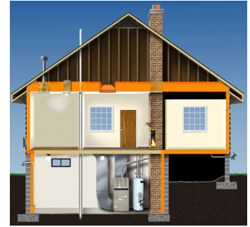
An energy efficient home saves money and cuts carbon emissions

RELI seeks public participation in energy policy decisions to encourage energy efficiency and use of renewable energy sources, and to protect our environment, economy, and public health.